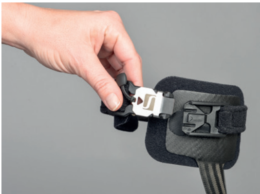
magnetic closure of the trade mark Fidlock